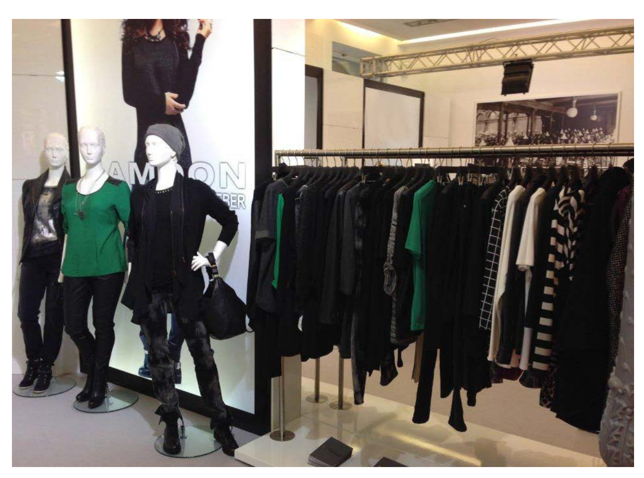
The SAMOON booth at the "Curvy is sexy" show

lection. Over the past seasons, we have steadily raised the fashion appeal of our collections to meet this very demand. And we use fabric types which cater to the needs of our customers, e.g. fabrics with a high stretch content.